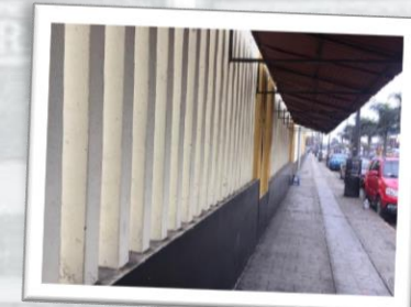
No Queue Outside Fatima!