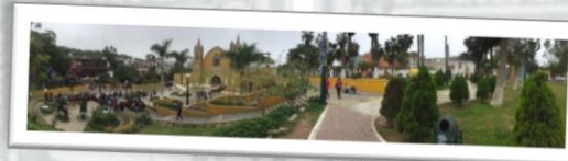
Bridge of Sighs, Barranco